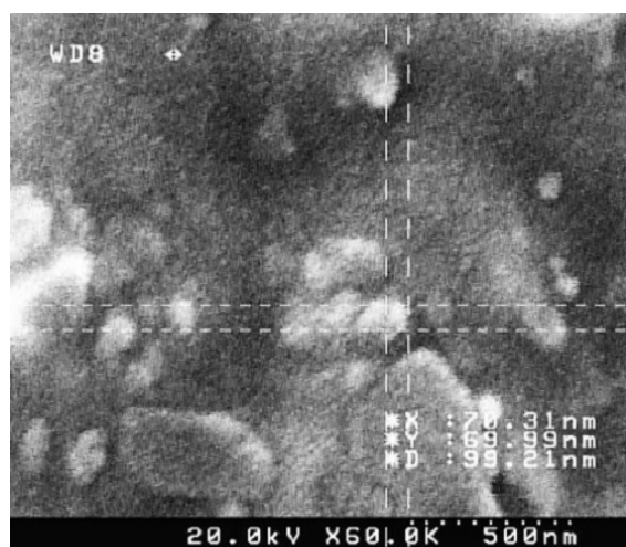
Figure 2: SEM image of nanoliposomal cisplatin